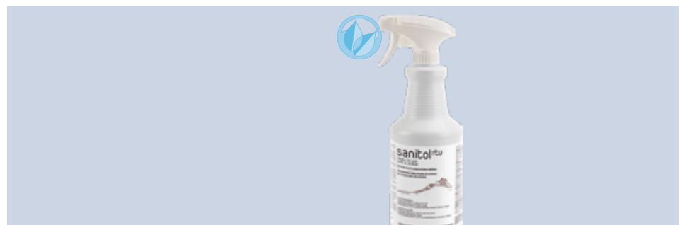
Fragrance Free SANRXWD – 12 x 950 mL