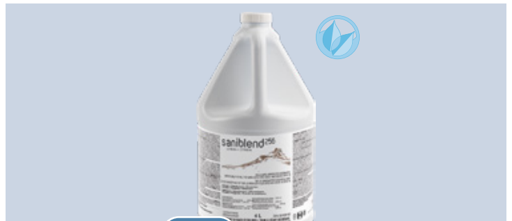
NEW Fragrance Free S256GW4 – 4 x 4 L