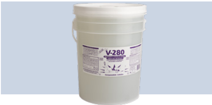
V280PN1 – 20 L