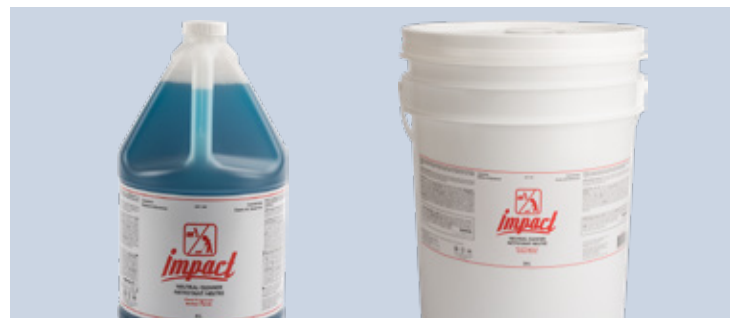
Floral NCFLGN4 - 4 x 4 L