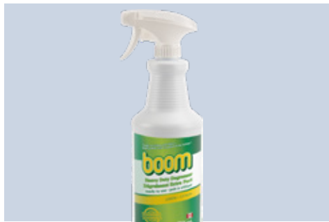
Lemon DRTLXWD – 12 x 950 mL