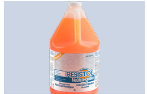
Orange NEBRGN4 - 4 x 4 L