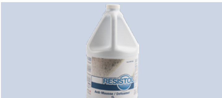
ANFOGW4 - 4 x 4 L