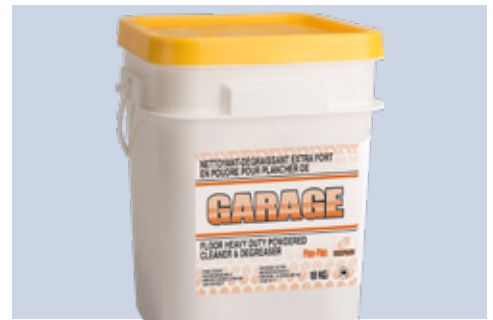
Pine PIPLIYX – 18 kg