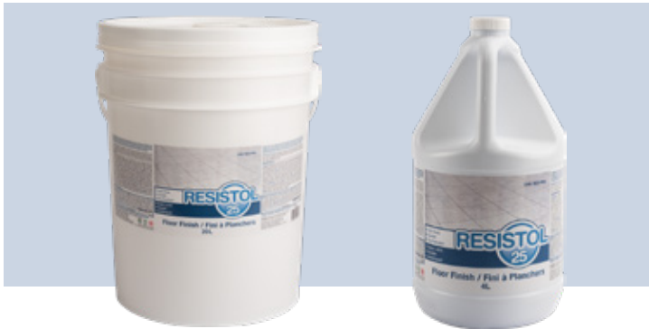
RE25PW1 – 20 L