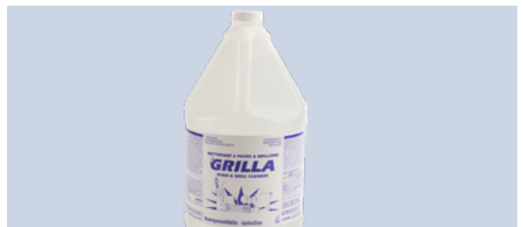
GRILGN4 - 4 x 4 L