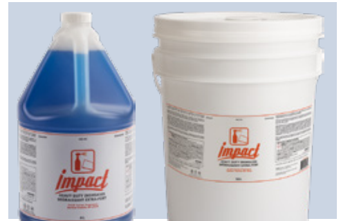
Lemon DXBLGN4 – 4 x 4 L