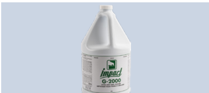
G200GW4 - 4 x 4 L