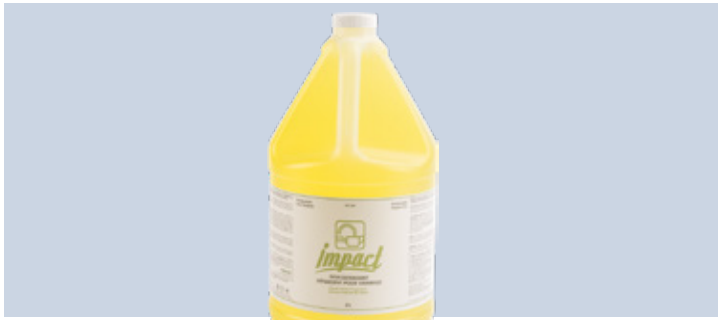
Lemon VCYLG4 - 4 x 4 L