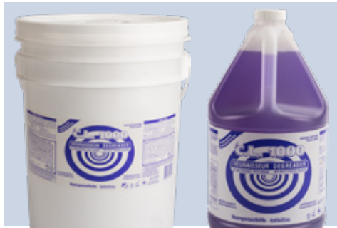
CL10PW1 – 20 L