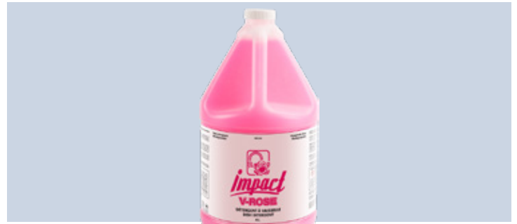
Clean Scent VROSG4 - 4 x 4 L