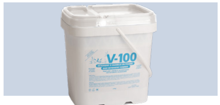
Pine V1008BS – 8 kg