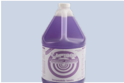
CLXFGN4 – 4 x 4 L