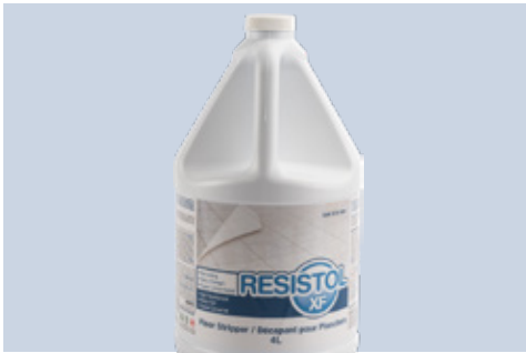
Lemon STXFGW4 - 4 x 4 L