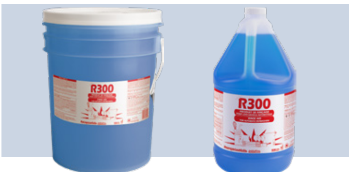
R300PN1 – 20 L