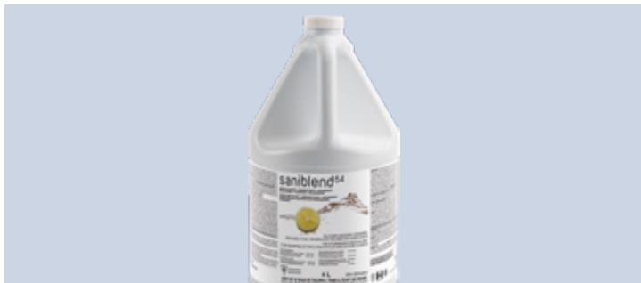
Lemon S64LGW4 – 4 x 4 L