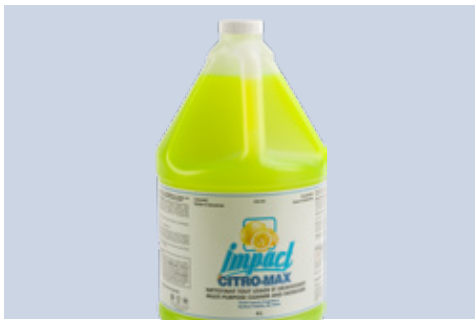
Lemon CIMAGN4 – 4 x 4 L