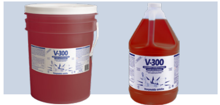
V300PN1 – 20 L