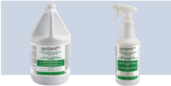
Lemon SRTLGW4 – 4 x 4 L