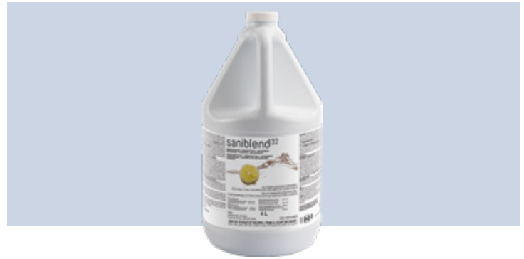
Lemon S32LGW4 – 4 x 4 L