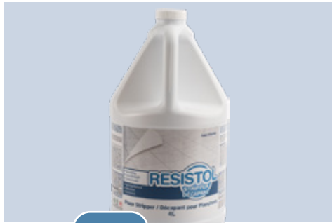
Lemon STRIGW4 - 4 x 4 L