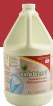
Fragrance free NCXXG04 – 4 x 4 L