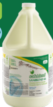
Fragrance Free S66XG04 – 4 x 4 L