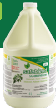
Peppermint oil SRXPG04 – 4 x 4 L