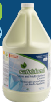
Fragrance Free WRBXG04 – 4 x 4 L