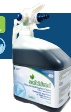
Fragrance Free WUBXMD4 – 4 x 2.85 L