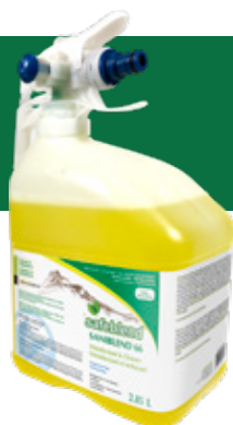
Fragrance Free S66XMD4 – 4 x 2.85 L