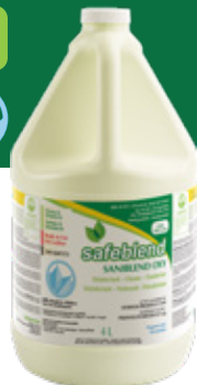
Fragrance free SRXXG04 – 4 x 4L