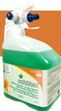
Floral ECFLMD4 – 4 x 2.85 L