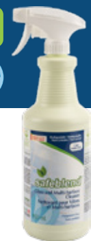
Fragrance Free WRBX0D – 12 x 950 mL