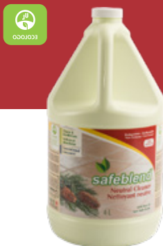
Pine NCPOG04 – 4 x 4 L