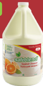
Orange NCORG04 – 4 x 4 L