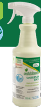
Fragrance free SRXXX0D – 12 x 950 mL