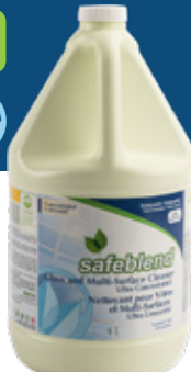
Fragrance Free WUBXG04 – 4 x 4 L