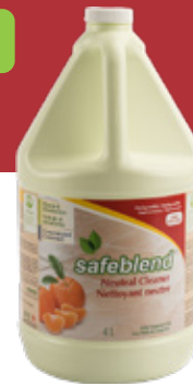
Tangerine oil NCTOG04 – 4 x 4 L