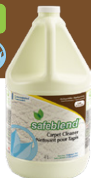
Fragrance free RCXXG04 – 4 x 4 L