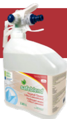
Fragrance free NUXXMD4 – 4 x 2.85 L