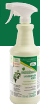
Peppermint oil SRXPX0D – 12 x 950 mL