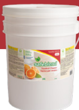
Orange NCORPW1 – 20 L