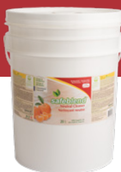
Tangerine oil NCTOPW1 20 L