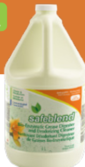
Floral ECFLG04 – 4 x 4 L