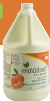
Tangerine oil XCTOG04 – 4 x 4 L