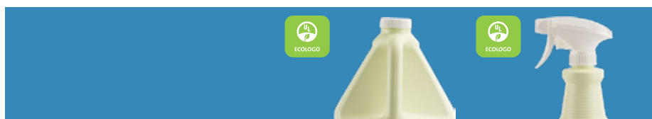
Fresh Scent BTFRG04 – 4 x 4 L