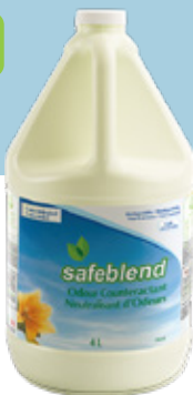
Floral OCGEG04 – 4 x 4 L