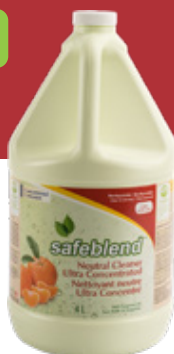
Tangerine oil NUTOG04 – 4 x 4 L