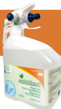
Fragrance Free DUXXMD4 – 4 x 2.85 L