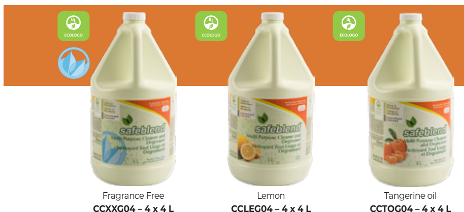
Fragrance Free CCXXG04 – 4 x 4 L