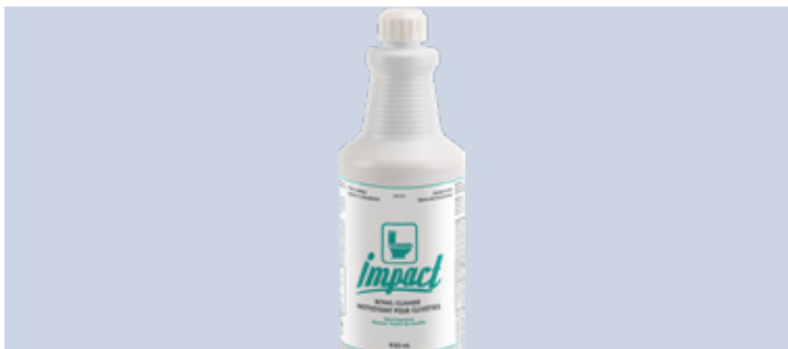
Mint BBMIFWD - 12 x 950 mL