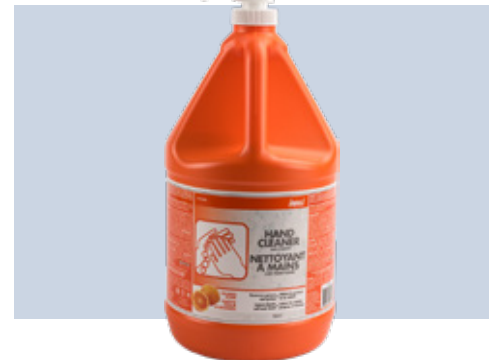
Orange HPORUR4 – 4 x 3.6 L