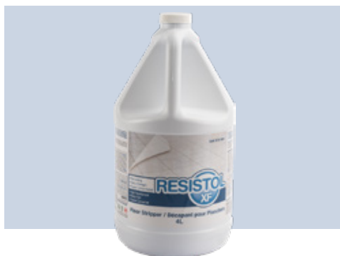
Lemon STXFGW4 – 4 x 4 L