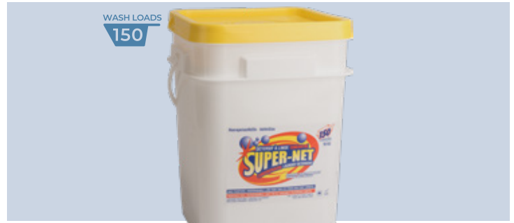
Lemon SUNEIYX – 18 kg