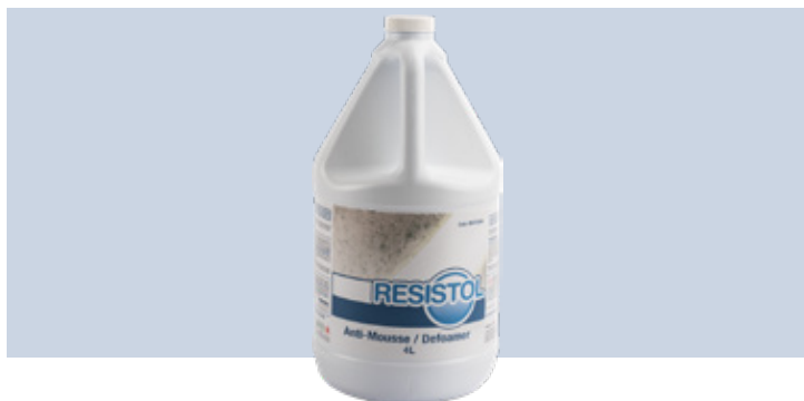
ANFOGW4 – 4 x 4 L