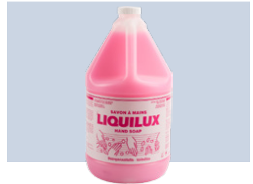
Baby Powder LIQUGN4 – 4 x 4 L