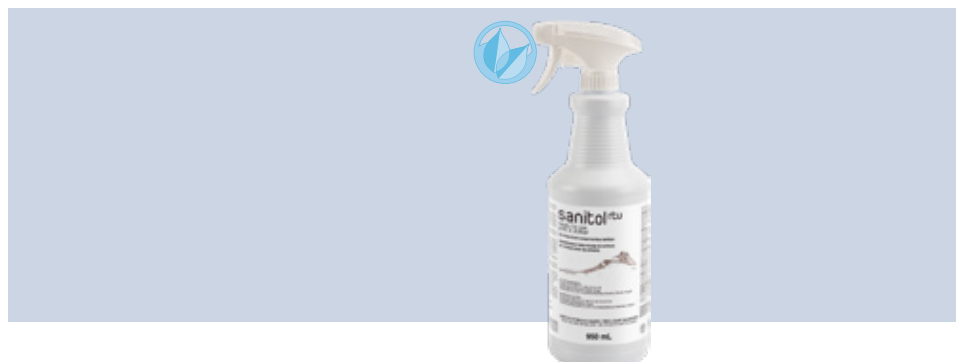
Fragrance Free SANRXWD – 12 x 950 mL