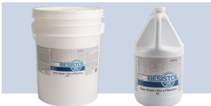
RE25PW1 – 20 L