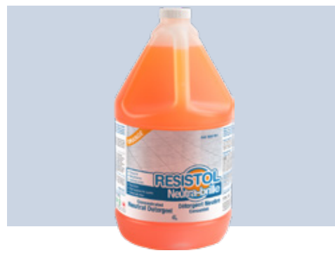
Orange NEBRGN4 – 4 x 4 L