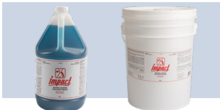
Floral NCFLGN4 – 4 x 4 L