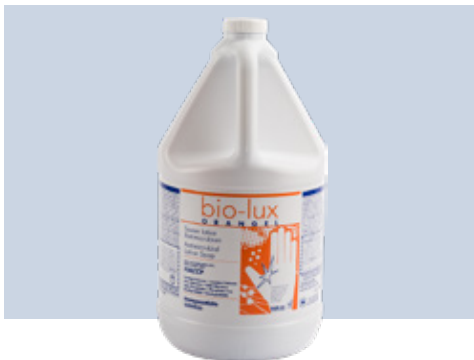
Orange BIORGW4 – 4 x 4 L