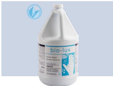
Fragrance Free BFXXGW4 – 4 x 4 L