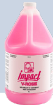
Clean Scent VROSG4 - 4 x 4 L