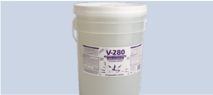
V280PN1 – 20 L