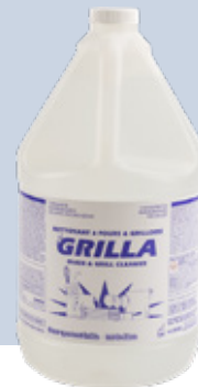
GRILGN4 - 4 x 4 L