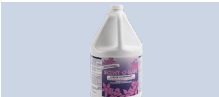
Floral SCSFGW4 – 4 x 4 L