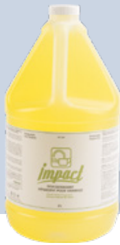
Lemon VCYLG4 - 4 x 4 L