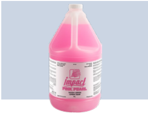
Cherry PIPEGN4 – 4 x 4 L