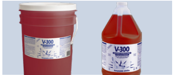
V300PN1 – 20 L