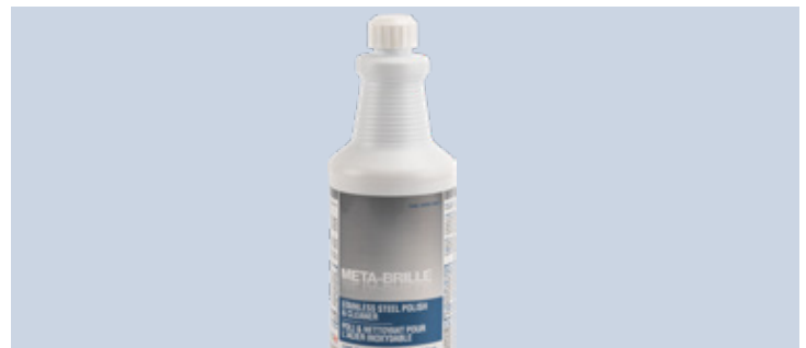
MEBRSWD – 12 x 950 mL