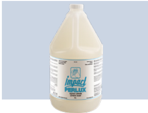
Almond PERLGN4 – 4 x 4 L