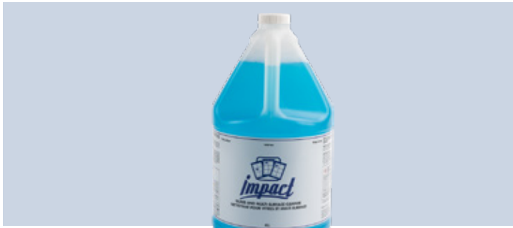
WRBIGN4 – 4 x 4 L