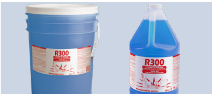
R300PN1 – 20 L