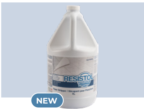
Lemon STRIGW4 – 4 x 4 L