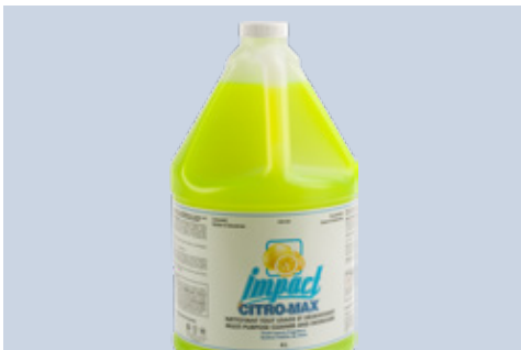
Lemon CIMAGN4 - 4 x 4 L