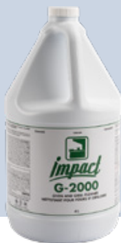
G200GW4 - 4 x 4 L